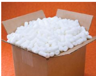
Styrofoam, peanuts, plastic coated boxes, containers, packaging