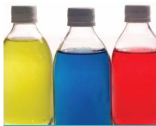
Liquids in containers