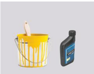
Explosives/Hazardous waste - i.e. motor oils, medical waste, sharps, etc.